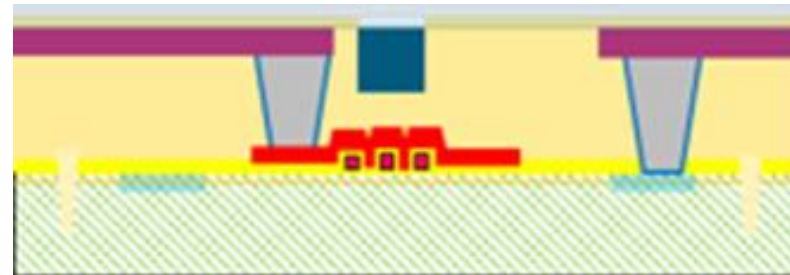
Integration scheme for micromagnets